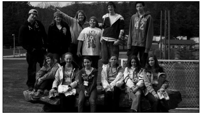
Some of the enthusiastic participants in confirmation program.

The Inter-Presbytery Confirmation Program is not intended to be a stand alone program, but rather to complement what is being offered in local congregations. It originated in the former Simcoe Presbytery where it ran successfully for several years prior to the restructuring. This is one program that has risen from